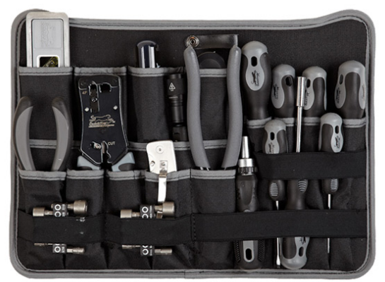
New and improved pallet design to maximize efficiency, capacity and increase aesthetics.